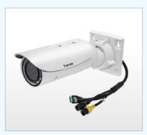
Embedded PoE Extender