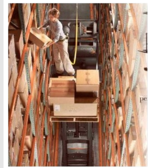
(Above) The 140,000 sq ft ware house was covered by 14 analogue CCTV cameras.

Tel. +44(0)1329 835335 Fax. +44(0)1329 835338 www.icode.co.uk/icatcher